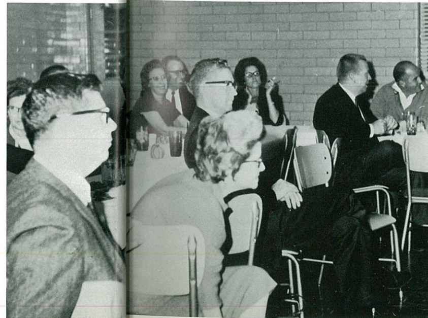
Board members, faculty, and spouses in relaxed moment

You have your ideals as to what your education should be. Follow that ideal until it changes to a higher one. Prepare yourself to meet the test that will some day come to you.