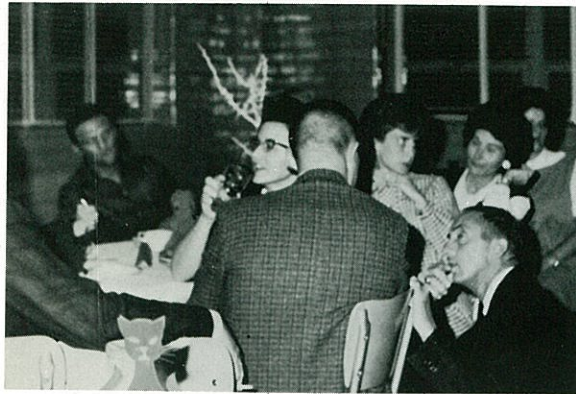
"This is our Seagraves strategy."