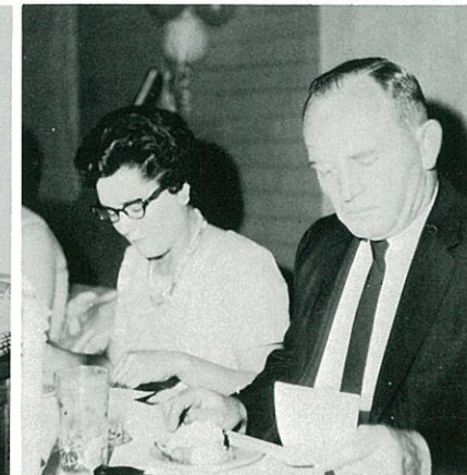
A serious man at serious work